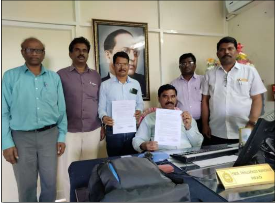
Receiving signed MoU copies from HoD Kakatiya University on 22-01-2020